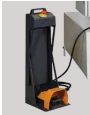
Foot pedal console with emergency stop button and hand grip