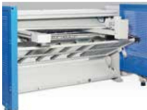
b) Sheets to the back