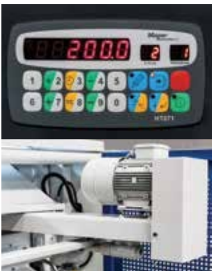
High quality programmable digital NC controller