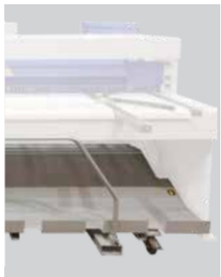
Sheet wagon movable on wheels