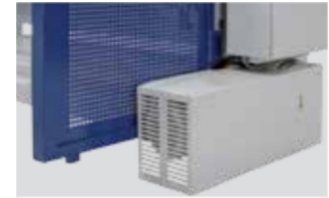
Motor mounted outside the machine frame to leave a totally free area under the table