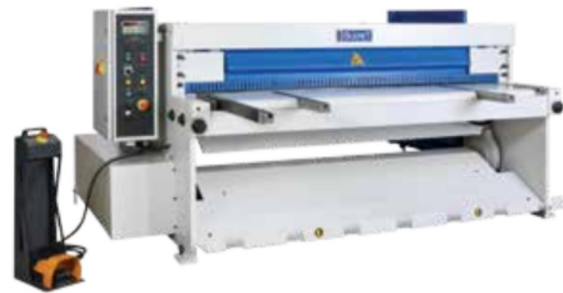
The RMT with its robust construction allows the users to get precise cuts without twists even on narrow strips