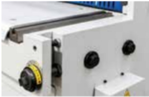
Two sided blade gap adjustment with position indicator