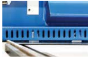
Rubber pads under holddown to avoid any marks or scratch on sheets