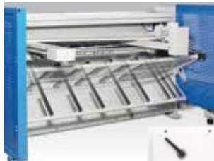
c) Sheets to the back or front with user setting