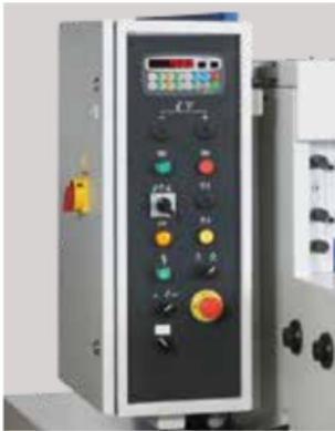
Control panel and electrical circuit in the same cabinet for easy reach