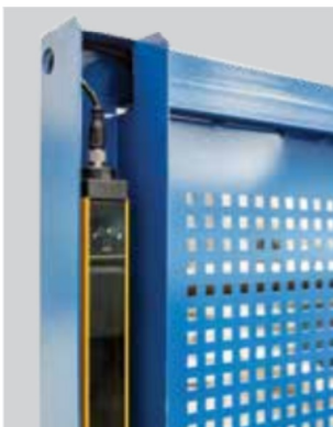
Full CE conformity protection with multi-beam light barriers and enclosures