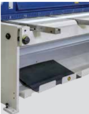
Sheet shute to bring cut plates to the front