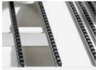
Rollers on arms of pneumatic sheet support