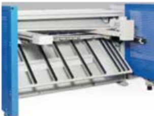
a) Sheets to the front