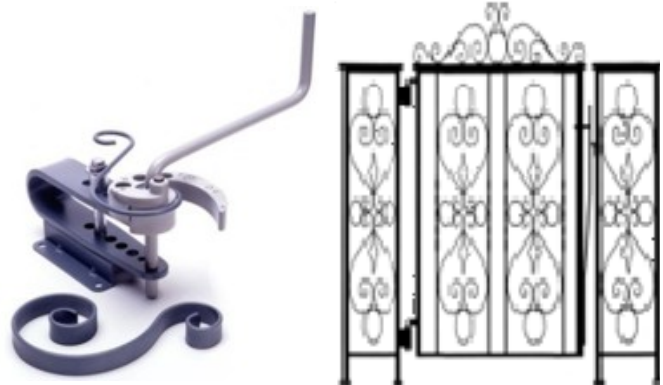
Bench mount stand (avec scroll attach