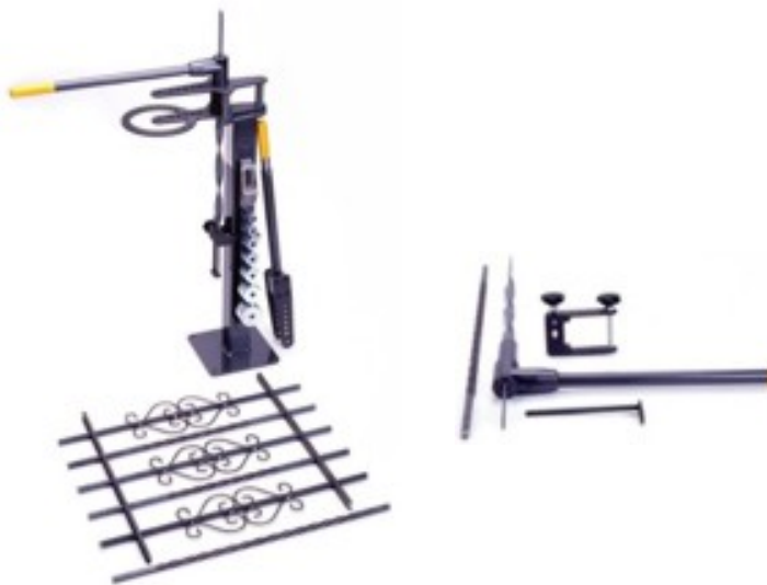
1/2" Picket twister attachment