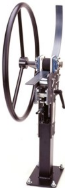
Pedestal Ring Roller