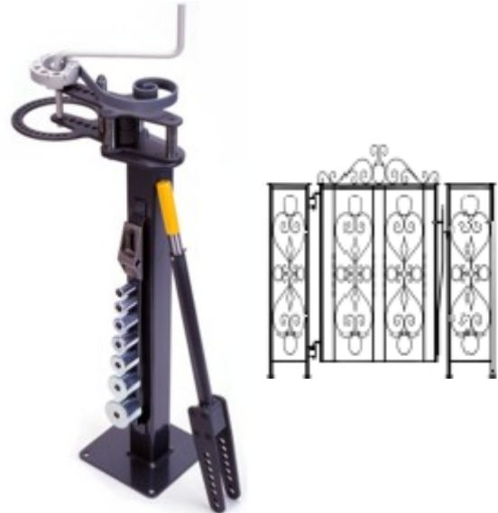
1" x 3/16" Scroll attachment